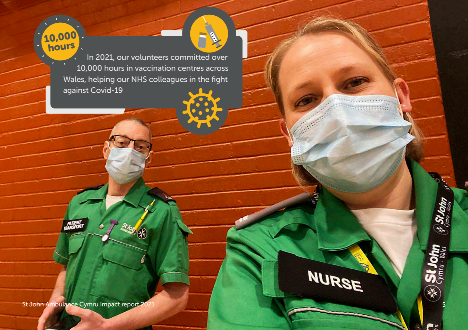
St John Ambulance Cymru Impact report 2021