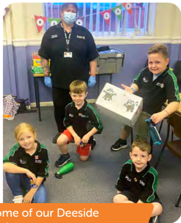
Some of our Deeside Badgers

✳ Despite our facilities being subject to lockdown and social distancing restrictions, we maintained many of our services through online portals